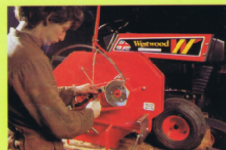
Skilled and careful manual assembly.