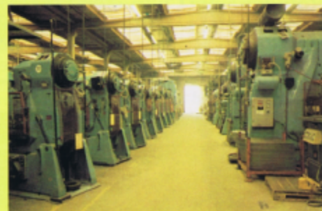
Modern production machinery gives Westwood almost complete self-sufficiency.