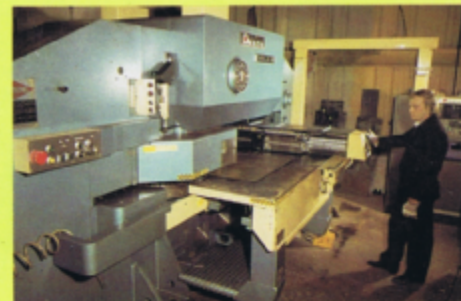
Computer controlled automatic presses improve quality and increase production.